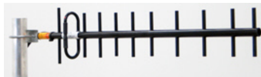
VALU890-14 is equipped with a standard feed line length of 2' LMR400 cable and N-Female connector.

To view polar plots for this antenna please visit www.wavelinkantenna.com/plots